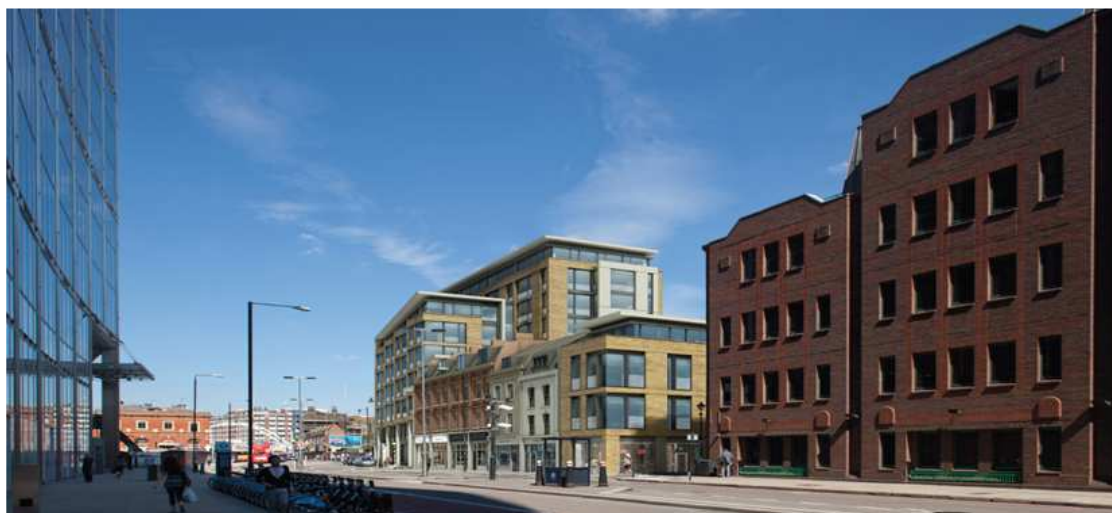
View from Norton Folgate/Shoreditch High Street looking north.